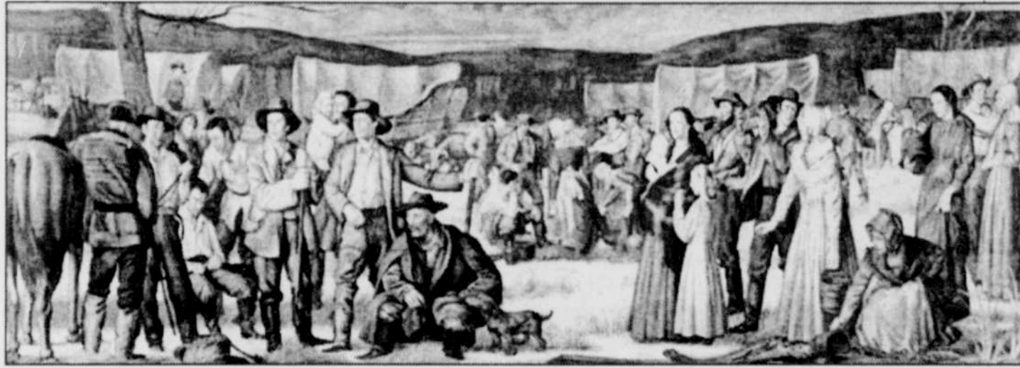
The fuzzy origin of Oregon's sodomy statute dates back to 1843, when white settlers created a Blue Book based on Iowa laws

The issue remained in limbo until Oregon's territorial Legislature issued its first official criminal code in 1850. The code did not mention sodomy, so it was clearly legal. But that didn't last long.