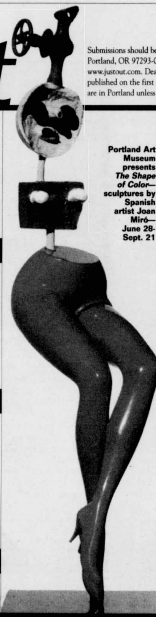
Portland Art Museum presents The Shape of Color—sculptures by Spanish artist Joan Miró—June 28-Sept. 21