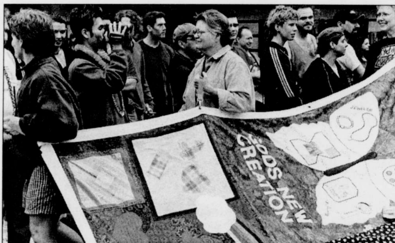
Members of the NAMES Project Foundation march through downtown during Portland Pride 2002

This year Pride Northwest is honoring two organizations and three individuals for their outstanding achievements within the sexual minorities community as well as their outreach to the larger community.