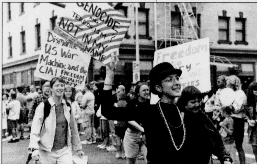
Pride Northwest's freedom of expression policy encourages unity and tolerance

Also, in years past our event has been attended by some fundamentalist protesters