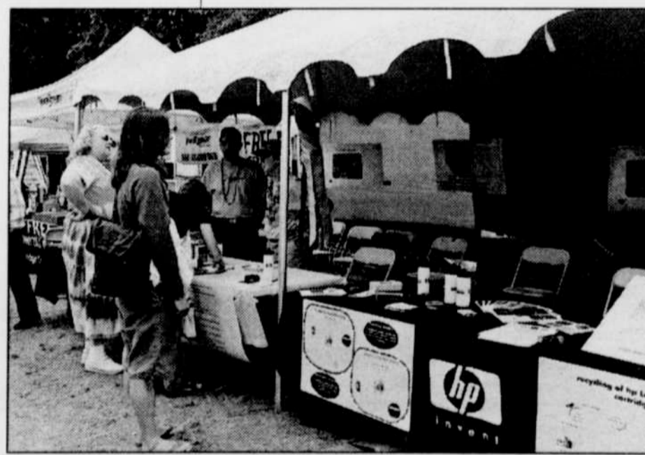
Festival organizers seek to create a safe and welcoming environment

9. No person shall refuse to comply with a reasonable directive of Pride Northwest, its designated volunteers or authorized contractors. [ ]