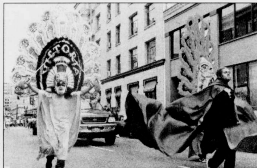
The parade is held on Sunday to increase anticipation and to ease downtown traffic rearrangements

Answer: Pride Northwest is a nonprofit 501(c)3 organization whose main objective is to organize the Portland Pride celebration every year. It is an all-volunteer board that strives to create a diverse and accessible event. The mission of Pride Northwest is to encourage and celebrate the positive diversity of the lesbian, gay, bisexual and trans communities and to assist in the education of all people through the development of activities that showcase the history, accomplishments and talents of these communities.