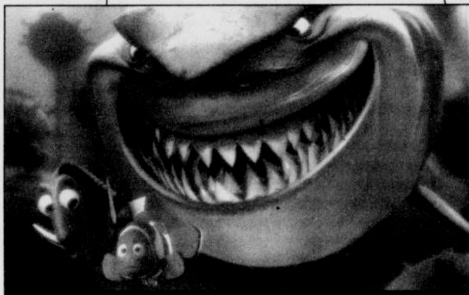
Marlin (voice of Albert Brooks) and Dory (voice of Ellen DeGeneres) have a hard time avoiding trouble in the captivating Finding Nemo

This folk music spoof from writer/director