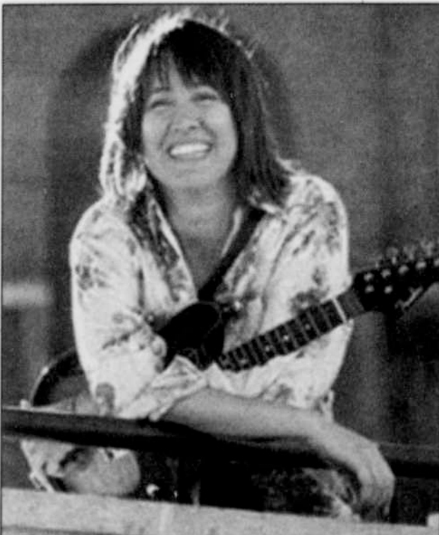
Celebrated dyke folk rocker Michelle Shocked plays twice—once for free—May 16 in Portland

You hold the hose at the Egyptian Club's Wet T-Shirt Contest . Arrive early to compete for an electric scooter. (9 pm. 3701 SE Division St. $4.)