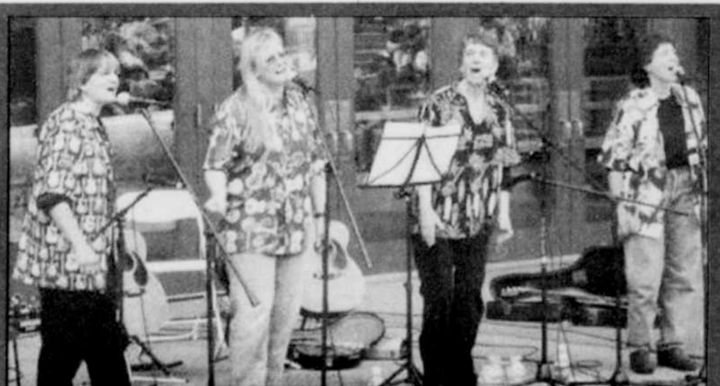
Motherlode finally returns to a Portland stage May 31!