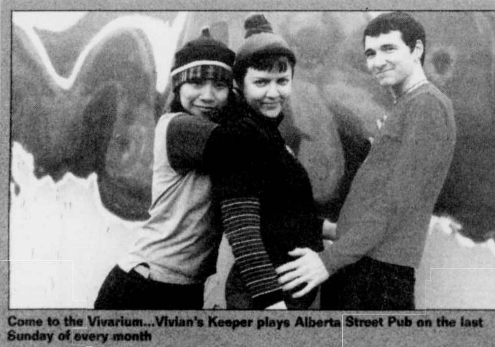
Come to the Vivarium... Vivian's Keeper plays Alberta Street Pub on the last Sunday of every month

P-town turns Beartown for a weekend of hugs and tugs, beer and brunch. Highlights include sightseeing, sailor review, Mr. Oregon Bear/Cub dinner and contest and Bear Trail pub crawls. ($85 members, $100 nonmembers. www.oregonbears.org.)