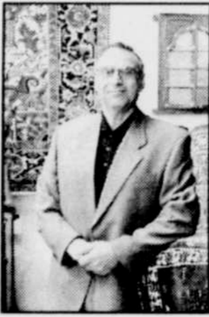
Take advantage of my 25 years experience to help you select your own heirloom quality rug at the absolute best price.

Decorative Traditional Kashans Tribal Gabbehs Modern Tibetans Rugs Are being sold at lowest prices ever.