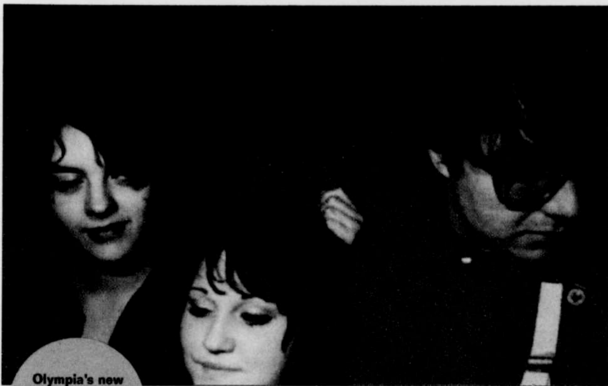
Olympia's new indie wonder band The Gossip play Portland on May 9 and 10

Are you a good witch or a bad witch? All will be revealed during Heaven or Hell: A Red and White Masquerade Ball at the Metropolitan Club. Nibbles, no-host bar, DJ and costume contest, sponsored by Portland Pagan Night Out. (8 pm-2 am, 618 SE Alder St. $10-$13 from www.anothermoon.com or at the door.)