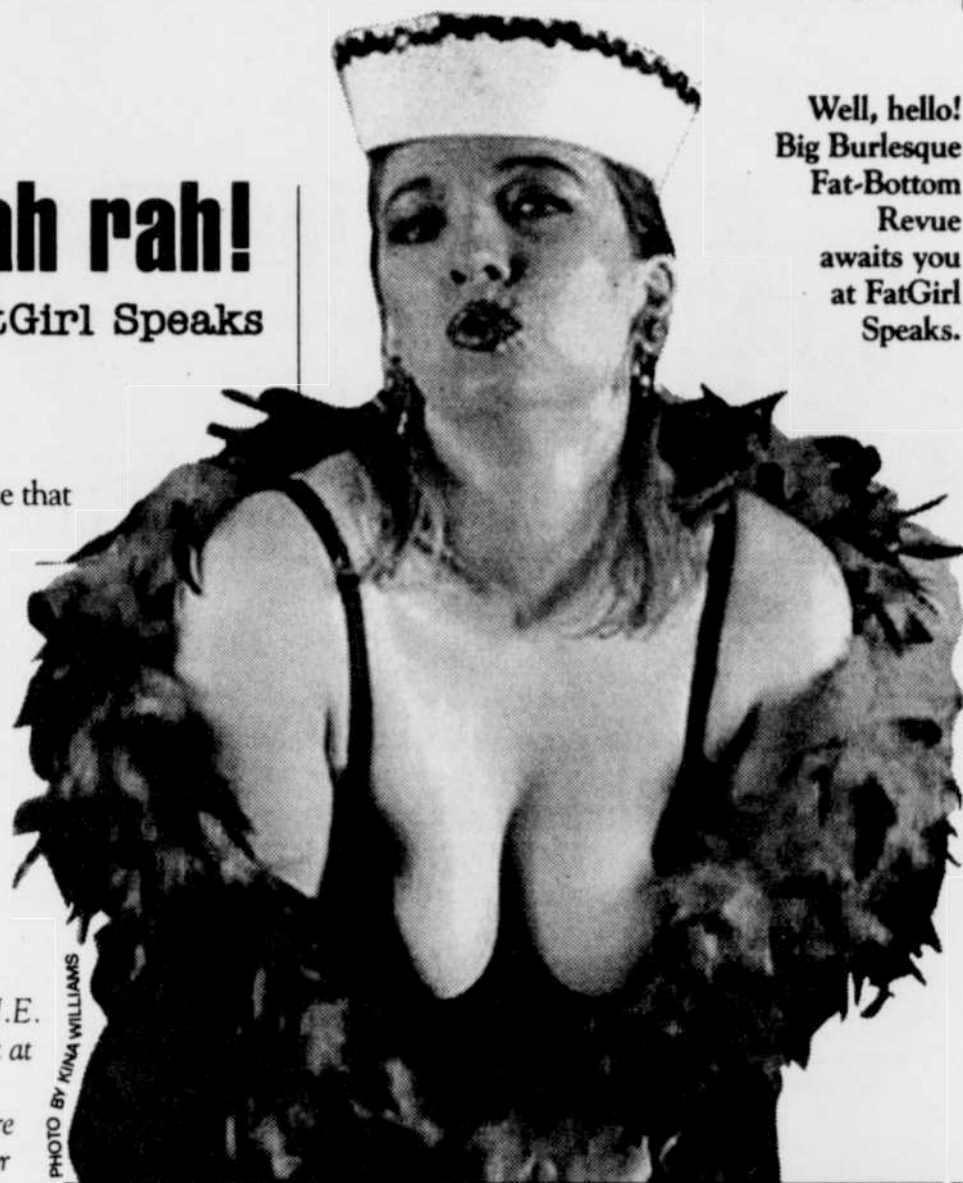
Well, hello! Big Burlesque Fat-Bottom Revue awaits you at FatGirl Speaks.