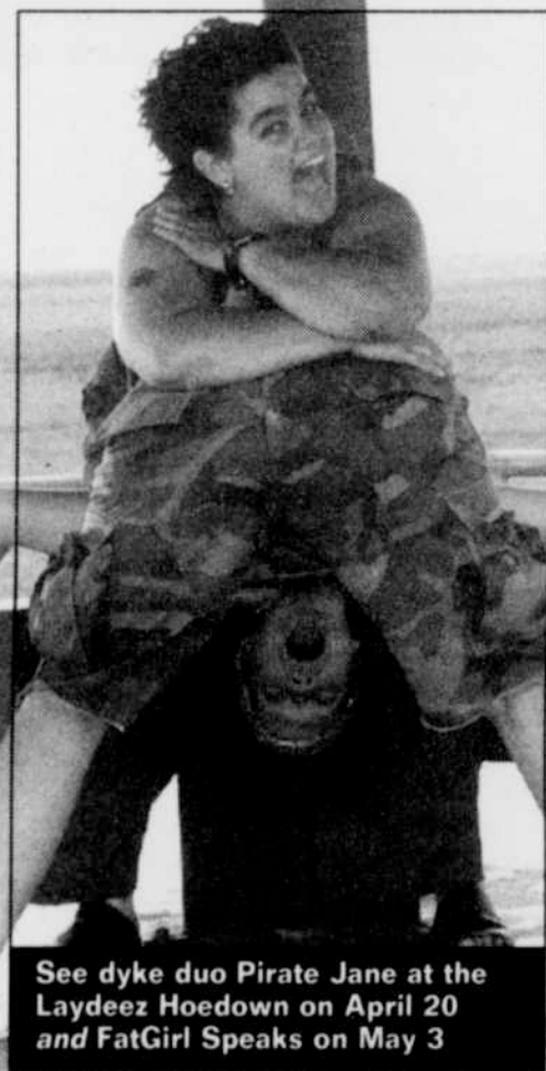
See dyke duo Pirate Jane at the Laydeez Hoedown on April 20 and FatGirl Speaks on May 3

If Church Slavonic language and Tchaikovsky music sound romantic, don't miss Capella Romana's performance of All-Night Vigil , Op. 52 at St. Mary's Cathedral. (8 pm. 110 NW 17th Ave. $15-$18 from 503-236-8202.)