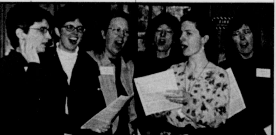
The Northwest Women's Music Celebration with Motherlode is April 25-27 at YMCA Camp Collins