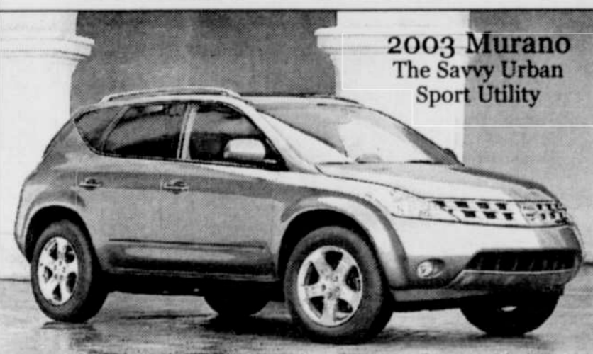
2003 Murano The Savvy Urban Sport Utility