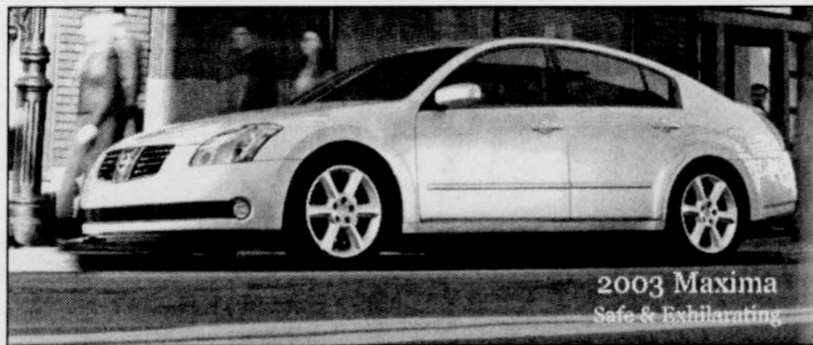
2003 Maxima Safe & Exhilarating