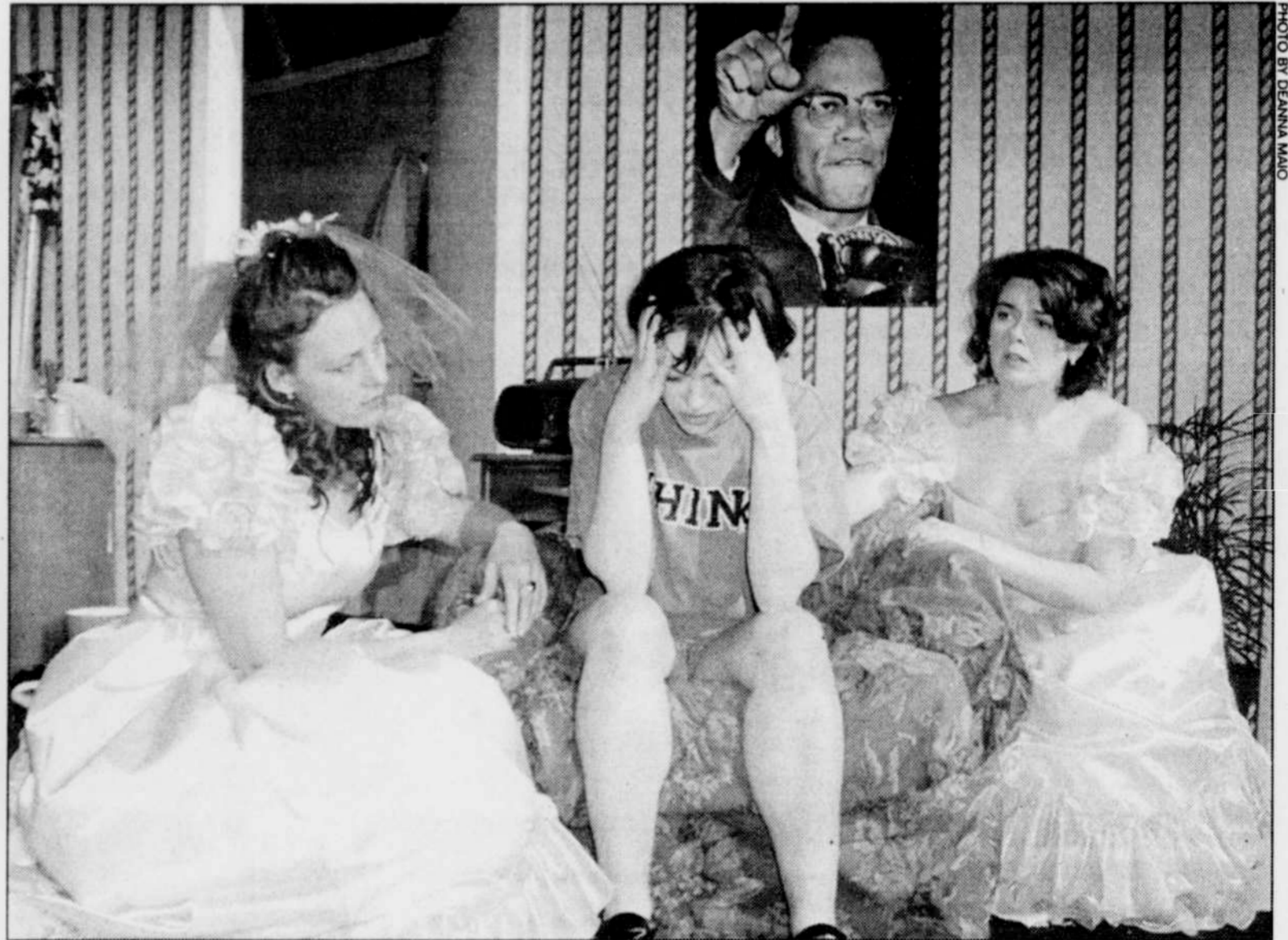
Always a lesbian bridesmaid, never a bride: Five Women Wearing the Same Dress runs through March 22

Magdelyn Theater Company extends Five Women Wearing the Same Dress through March 22 with a cast of bridesmaids that includes Frances, a painfully sweet