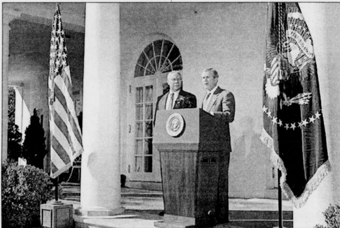
As Secretary of State Colin Powell and President Bush prepare for war on Iraq, the U.S. military seems to be stepping up its witch hunt against queer soldiers