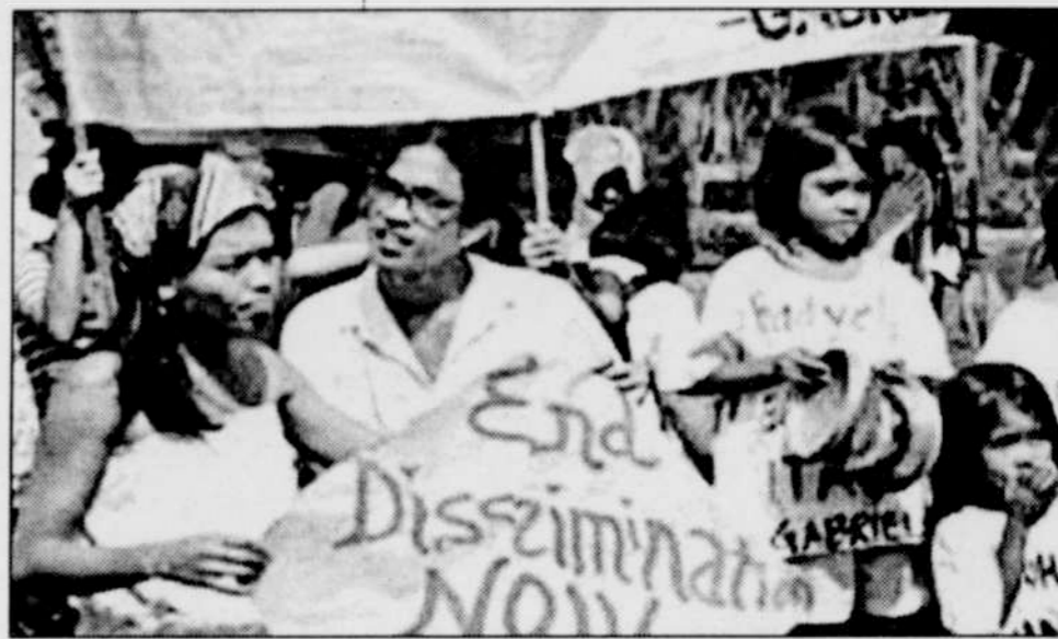
Cardinal Jaime Sin's comments caused outrage in the Philippines