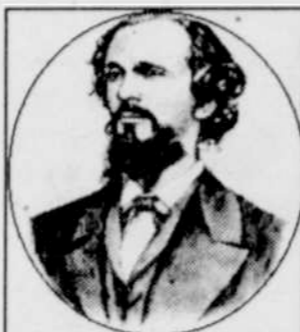
Karl Heinrich Ulrichs

ITALY The L'Aquila City Council voted Jan. 15 to restore the grave of pioneering gay activist Karl Heinrich Ulrichs.