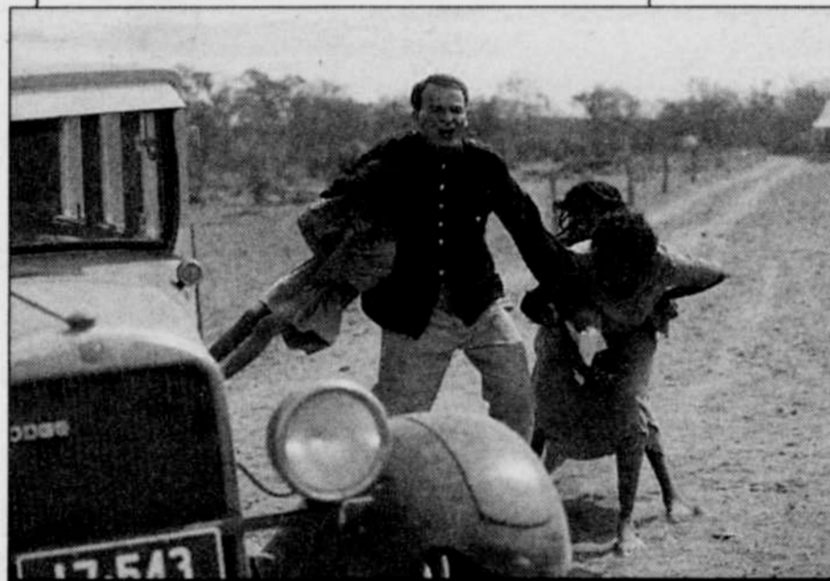
Just when you thought you knew all of history's systematic racial injustice, along comes Rabbit-Proof Fence to Cinema 21