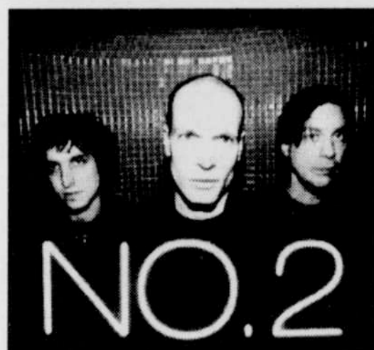
WHAT DOES GOOD LUCK BRING? No. 2 • In Music We Trust