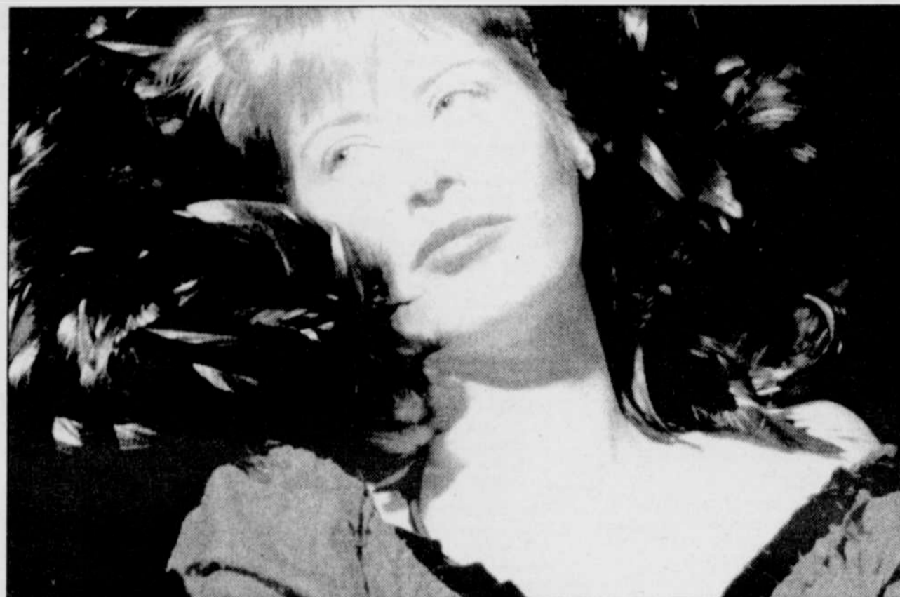
Myshkin's Ruby Warblers play Jan. 4 at Alberta Street Pub

The room quiets. A woman walks on stage with a shiny guitar, dusty boots and a gorgeous, wise smile. The initial excitement of finger-picking and steady strumming swells into the rush of vocals that makes you rethink your master plan.