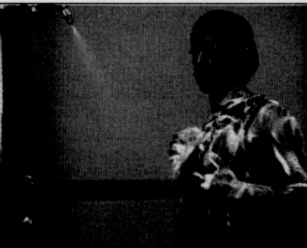
Juwanna Mann (Miguel A. Núñez Jr.) blends right in

Juvenile flicks Sorority Boys , Juwanna Mann and The Hot Chick predictably played right into homophobic dudes' worst fears about gender-bending. How original.