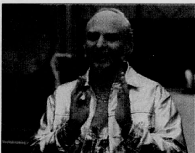
Goldmember (Mike Myers) creeps out Dr. Evil

First, Frau Farbissina joined the women's golf circuit. Now this. On top of the whole world domination thing, Dr. Evil revealed a homophobic streak in Goldmember , the latest installment of the increasingly bizarre Austin Powers series. The villain bristled when the title character, a Dutch freak with a 24-karat schlong, complimented his physique ("Dr. Evil, you look very toit—yes, you look like a macho man"). Mike Myers, who played both parts, replied, "You know, Goldmember, I don't think that's something one dude should say to another dude—yeah, a little creepy."