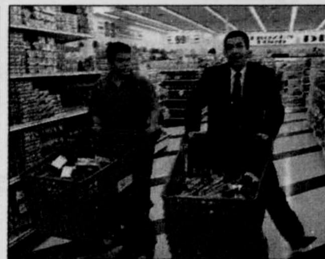
Punch-Drunk Adam Sandler loves shopping

Richard Gere did little to quell those gerbil-jamming rumors this year. In Unfaithful he was the cuckold husband of adulteress Diane Lane. Later this month he'll star in Chicago , which happens to be a MUSICAL written by a GAY MAN (Bill Condon of Gods and Monsters fame). Need we say more?