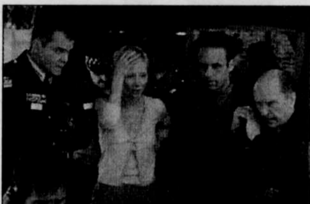
Anne Heche summons Celestia

Was this 2002 or 1952? With Elvis returning to the top of the albums chart and Republicans dominating in D.C., it would stand to reason that the year's most acclaimed film was Far from Heaven , gay Portland writer/director Todd Haynes' absorbing homage to Douglas Sirk melodramas.