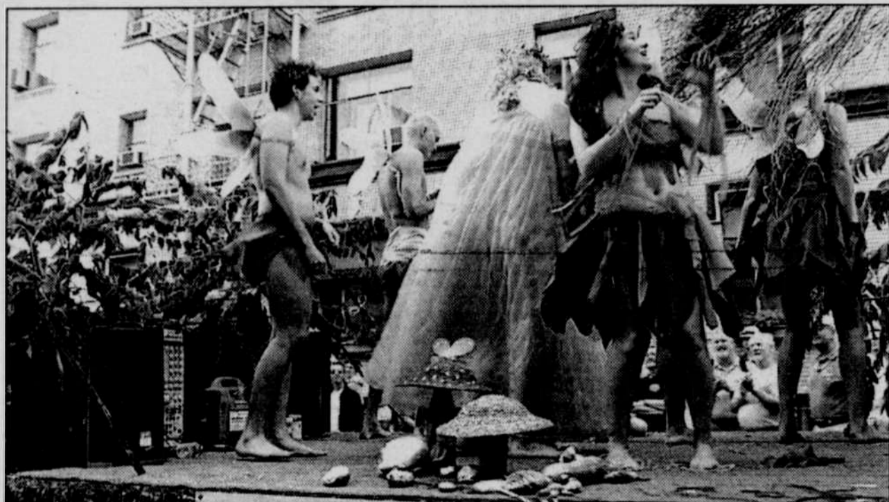
The Portland Pride 2002 parade filled downtown with 50,000 marchers and spectators