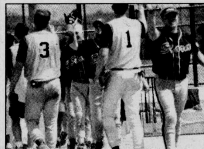
The Rose City Softball Association brought more than 2,000 queers to town for World Series 2002