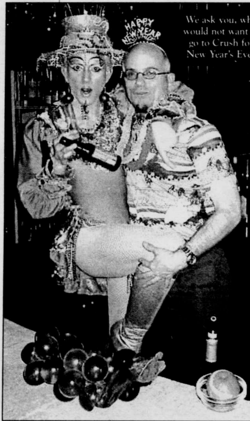
We ask you, who would not want to go to Crush for New Year's Eve?

A disco cover band, light shows and climactic midnight ball-dropping make a tame alternative to the traditional gay guzzle-and-nuzzle. (But, hey, there's no accounting for taste.) Gates open at 7 p.m., music starts at 9, and it's free. [ ]