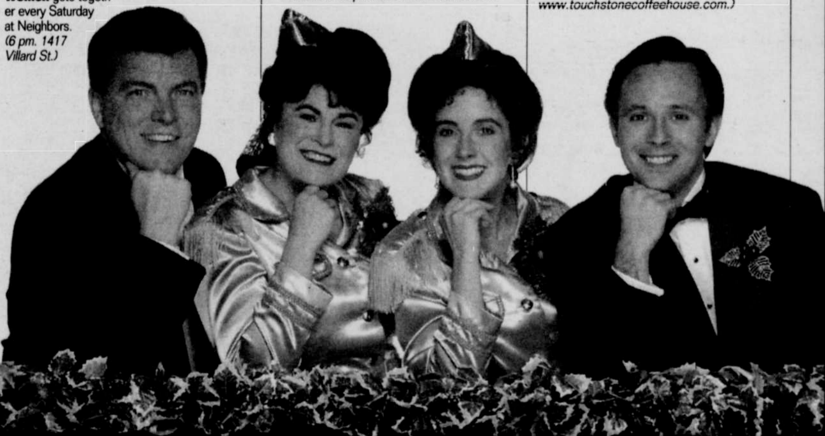
Broadway Rose Theater Company presents G.I. Holiday Jukebox through Dec. 22