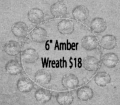
6" Amber Wreath $18

3206 SE Hawthorne Blvd, Portland, OR 97214 503.230.7033 ~ www.heavenandearth.net Tues-Sat 10-6:30 Sun 12-5 Open Mon 10-6:30 between 12/16-12/30