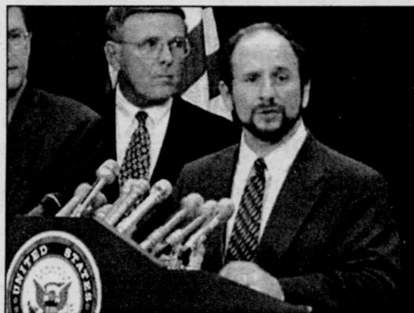
The sexual minorities community lost a strong ally when U.S. Sen. Paul Wellstone, D-Minn., was killed in a plane crash shortly before Election Day

Many U.S. citizens feared a deterioration of personal rights and liberties in the post-Sept. 11 environment. The courts have not adopted that mind-set. They have supported the right to counsel and have struck down attempts at censorship on the Internet.