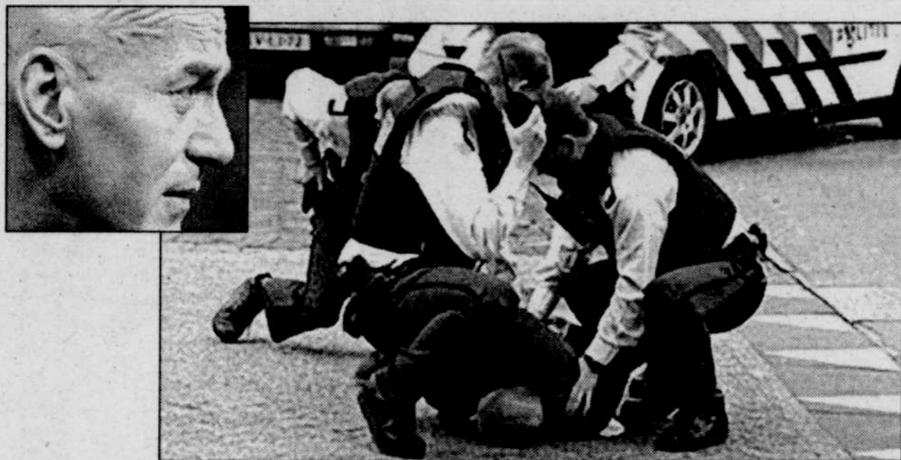
Police arrest gunman Volkert van der Graaf, who since has confessed to killing Dutch leader Pim Fortuyn (inset)

stone, D-Minn., died in a plane crash in October. Anti-gay Tom DeLay, R-Texas, advances to majority leader in the House, but it will be little change from the retiring Dick Armey, R-Texas, of "Barney Fag" fame.