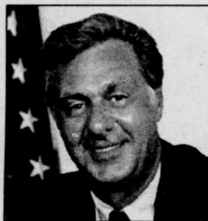
Good riddance: U.S. Sen. Jesse Helms, left, and House Majority Leader Dick Armey went off into the sunset this year