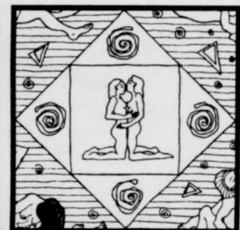
Give the gift of lust from Lustylinen.com