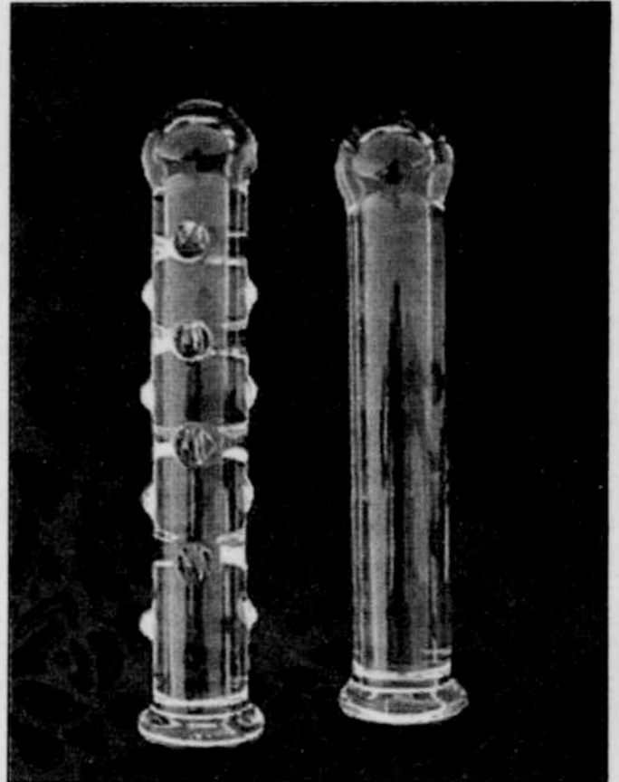
a blown glass dildo. Made by a Portland artist, these gorgeous pieces are not only smooth and sexy, they also look great on the coffee table.

This holiday season, check out It's My Pleasure for sex-positive gifts to excite and empower. Don't miss: