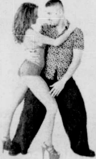
"Moral Reality" Tues 11:30p on Ch. 11