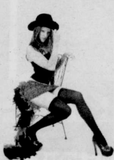
We all do it. Let's talk about it.