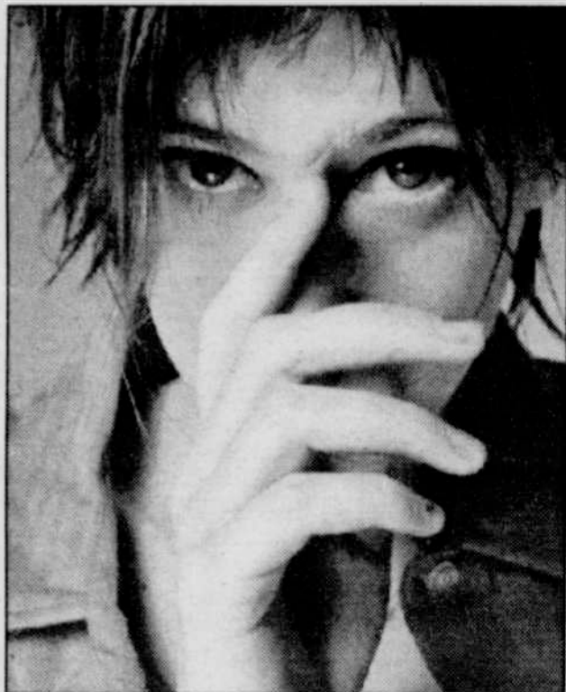
The captivating Beth Orton induces shivering Nov. 21 at Roseland Theater