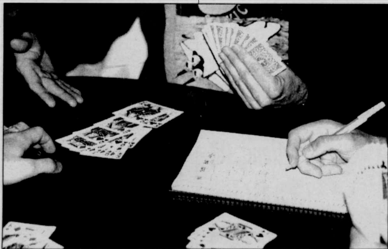
The second annual pinochle tournament is Nov. 23 at Hobo's