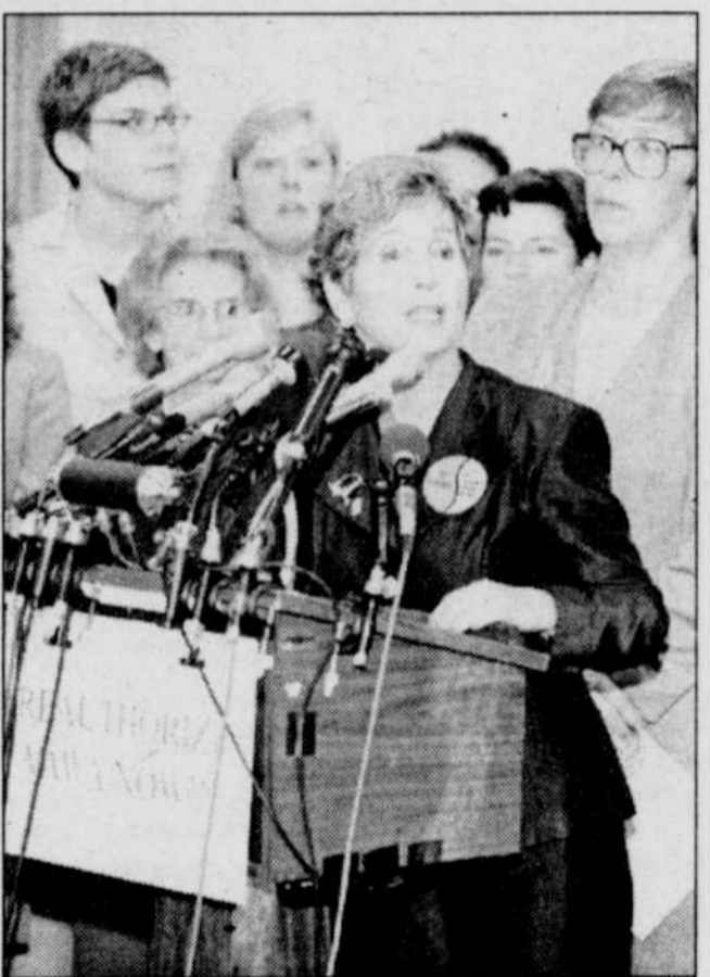
Rep. Connie Morella of Maryland, one of the few pro-gay House Republicans, was defeated in her bid for re-election

Republicans padded their slim control of the House of Representatives with the final total likely to add a handful of seats. Perhaps the toughest loss for the queer community was that