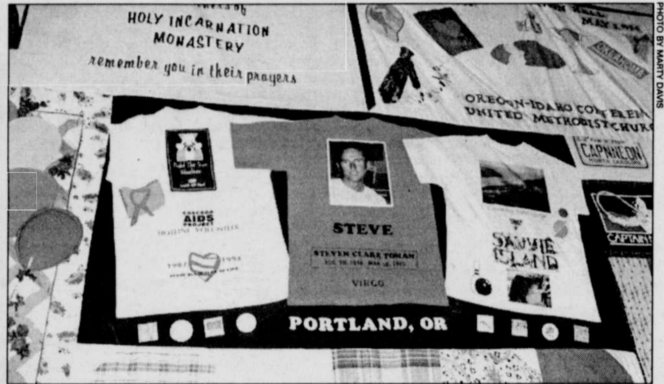
Budget cuts might result in fewer displays of the AIDS Memorial Quilt in Portland