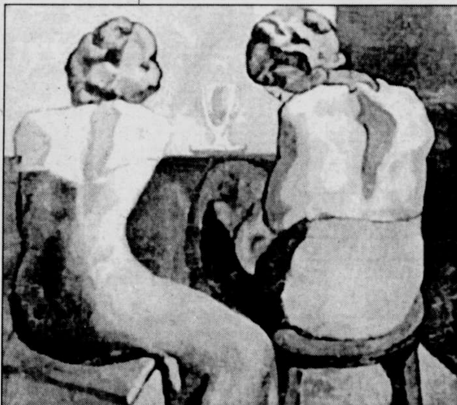
TWO LADIES SITTING AT A BAR BY PABLO PICASSO