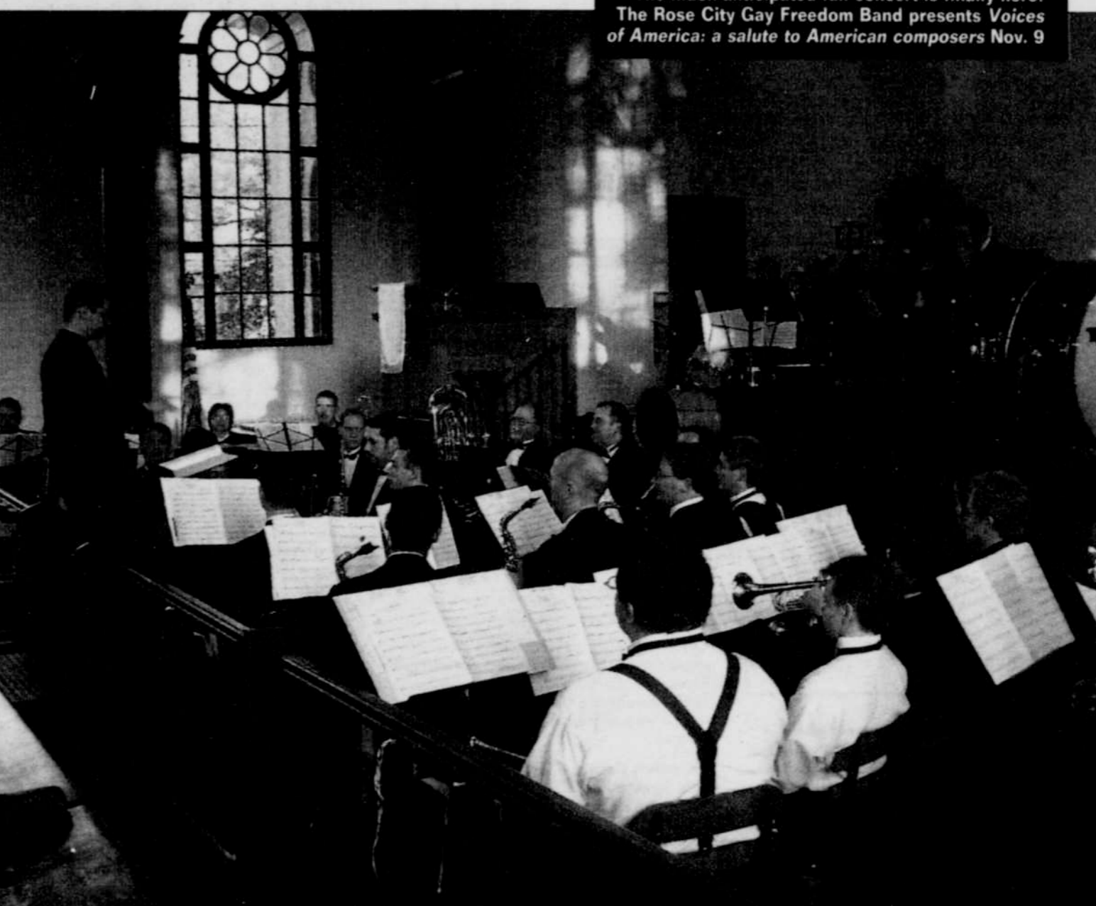
The much-anticipated fall concert is finally here! The Rose City Gay Freedom Band presents Voices of America: a salute to American composers Nov. 9