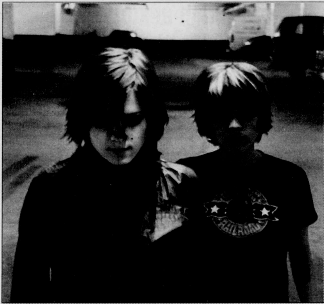
Fall in love with Tegan and Sara on Oct. 30 at the Roseland