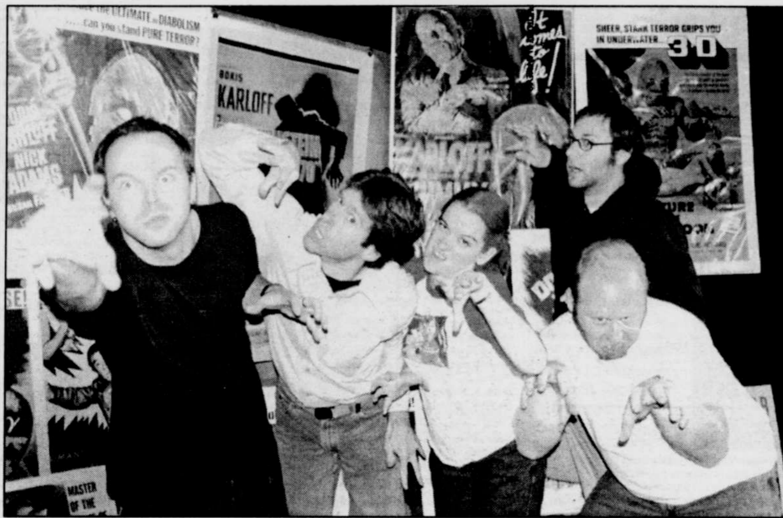
The Brody Theater gets scary through Nov. 2

Deaf & Hearing Out Reach (DHOR) is a new nonprofit dedicated to building community among deaf and hearing queers and allies through social, educational and community resources in an inclusive environment. We offer queer American Sign Language classes and sponsor monthly queer deaf events. (503-235-0840, queerasl@yahoo.com.) (11/02)