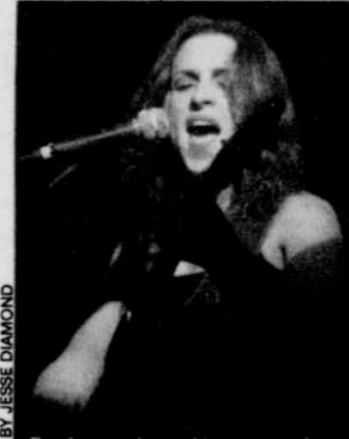
Seek out the sultry acoustics of Tamaras on Oct. 23 and 30

Compass World Bistro presents A Celebration of Harvest Time as part of Dinner at My House for Our House , a fund-raiser series for Our House of Portland. Make reservations for this cozy, elegant meal of sweet potato pancakes, hearty spiced corn, winter squash soups and sautéed duck breast. (5:30 pm. $75. For a brochure listing all the dinners or to make reservations, call 503-736-9276.)