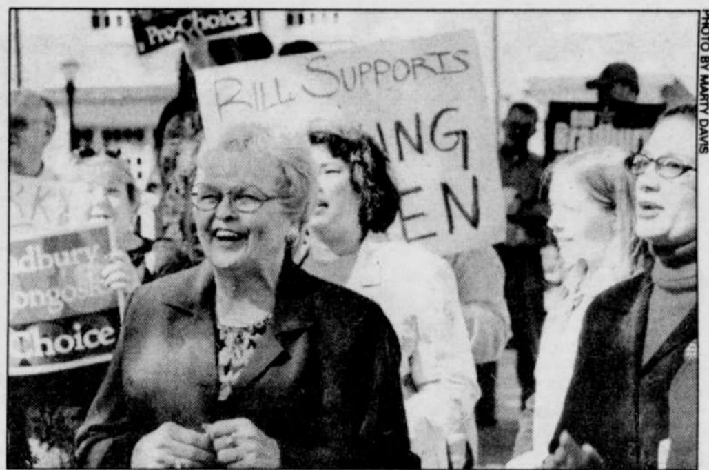
Former Gov. Barbara Roberts, a onetime HRC board member, leads a "100 Women for Bradbury" rally Sept. 19 in downtown Portland

"Gordon Smith would like you to believe that he's a friend to the gay and lesbian community because he supports the Employment Nondiscrimination Act and because he supports hate crimes legislation—and that's great. The only problem with that is that the Repub-