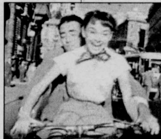
Be like Audrey!