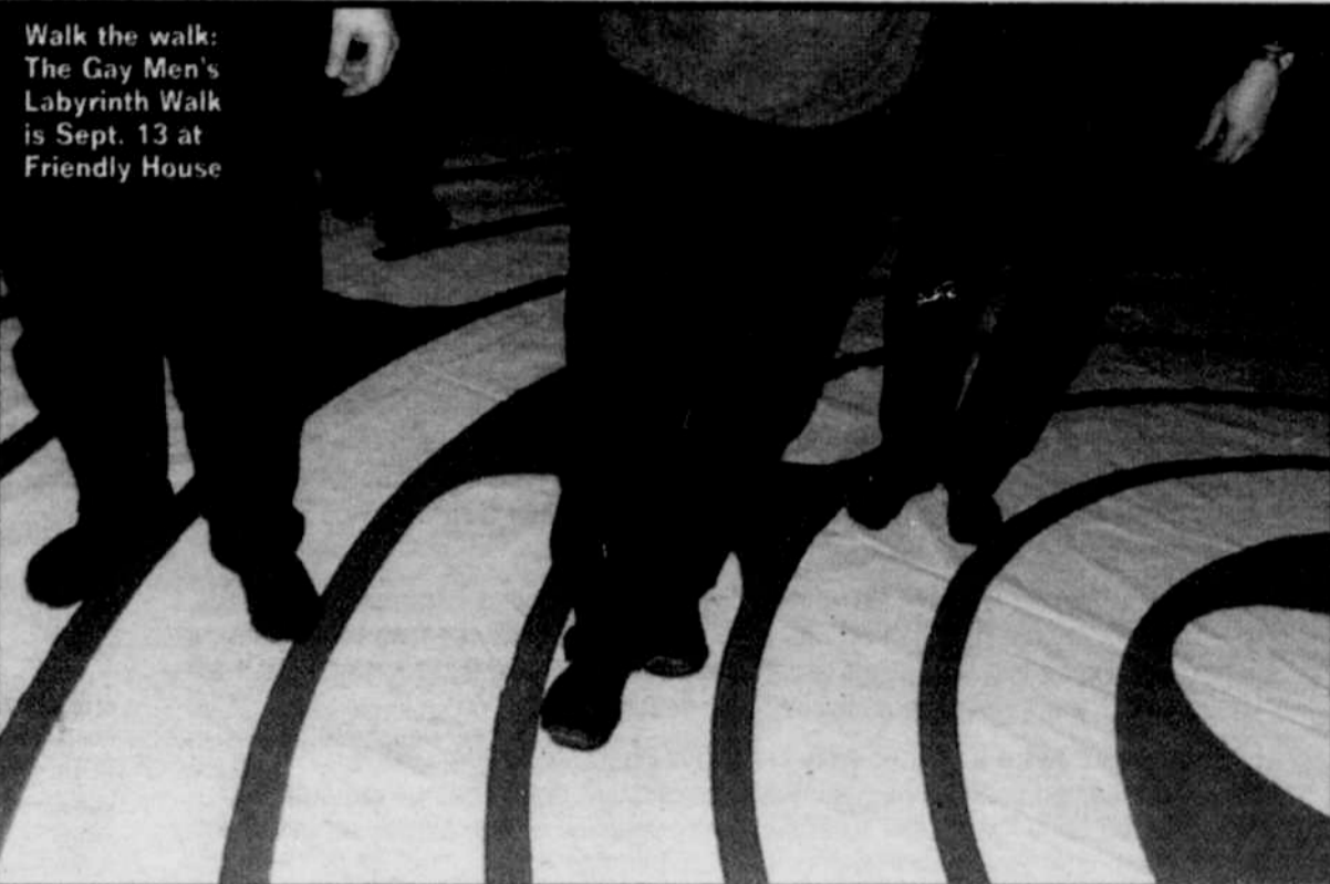
Walk the walk: The Gay Men's Labyrinth Walk is Sept. 13 at Friendly House

Sensory Perceptions presents the sixth annual Portland Lesbian Gay Bi Trans Film Festival through Sept. 29 at Cinema 21. Pick up a schedule around town for this 10-day event featuring more than 30 films and filmmaker appearances. (www.sensoryperceptions.org.)