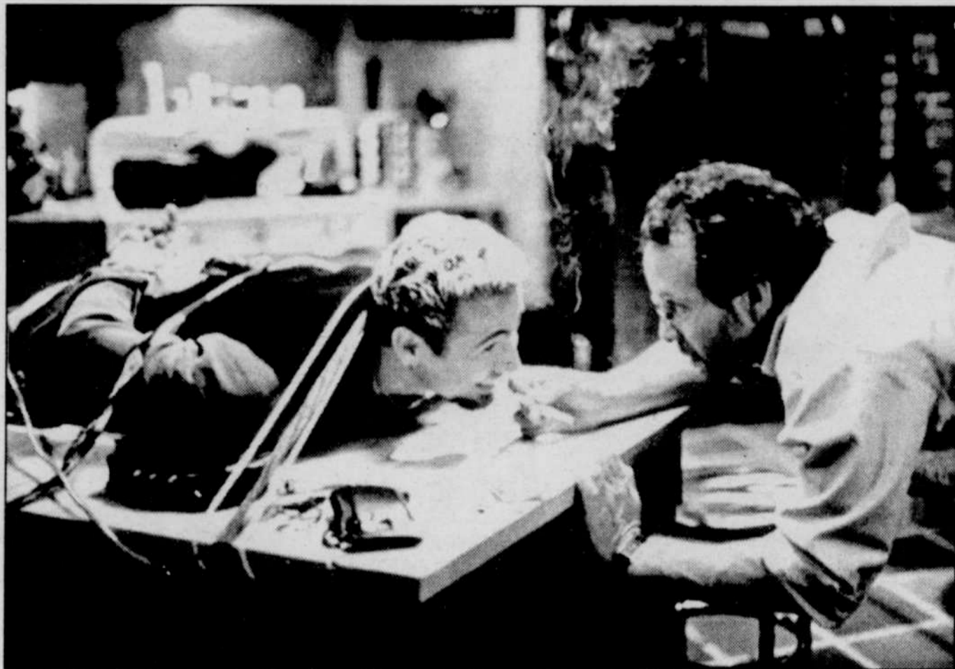
Steve Guttenberg contemplates revenge on hustler/burglar Lombardo Boyar in P.S. Your Cat Is Dead