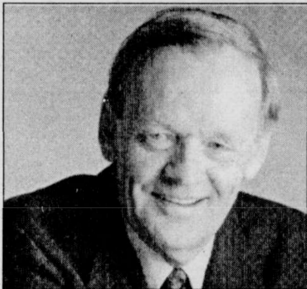
Canadian Prime Minister Jean Chrétien has called for hearings on same-sex marriage

"The business model of the small gay and lesbian bookstores has become outdated," he told Fugues . "Gay and lesbian culture is now present everywhere and available in regular stores, and gay men and lesbians are not buying only gay products."