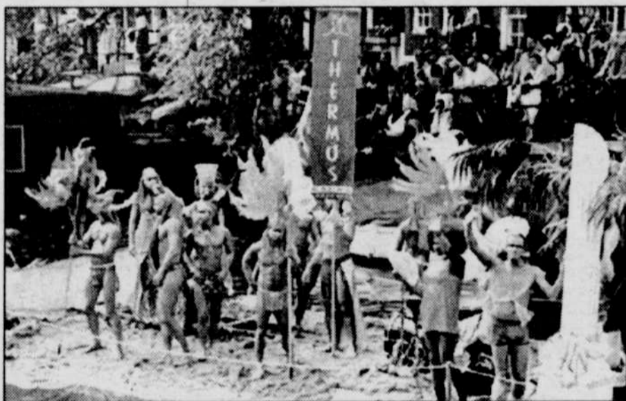
Dutch queers celebrate Aug. 3 in Amsterdam