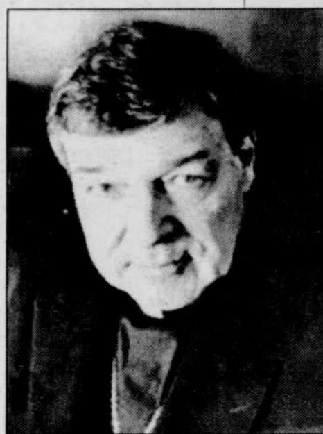
Sydney Archbishop George Pell has been accused of having sex with a 12-year-old altar boy

Vancouver gay man filed a complaint against the site in 1999, saying it violated his rights under the nation's Charter of Rights and Freedoms.