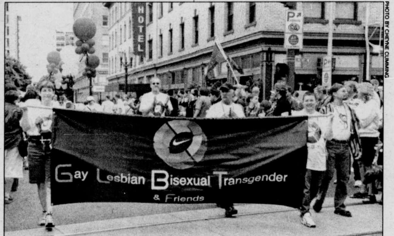
Nike employees march through downtown June 16 during Portland Pride 2002

Gay, lesbian, bi and trans voters will have a chance to talk policy and bowl a few frames with the man who is likely to be the