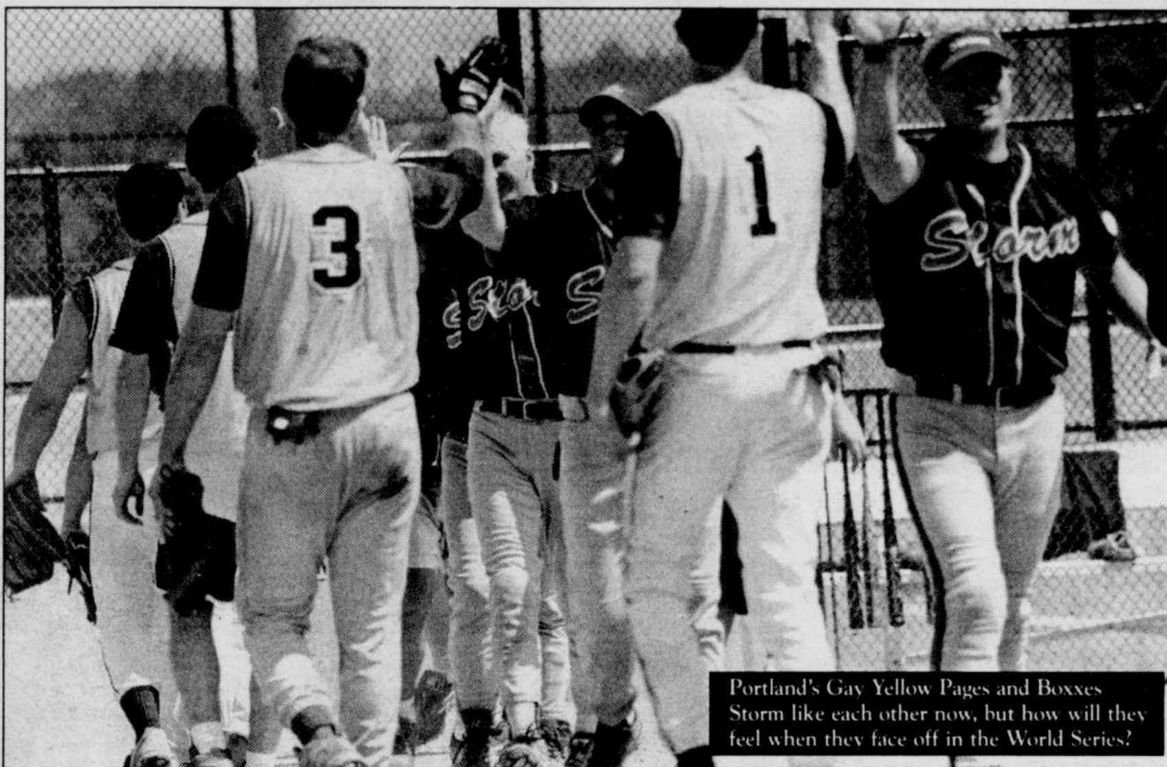
Portland's Gay Yellow Pages and Boxxes Storm like each other now, but how will they feel when they face off in the World Series?

Y ou know it's a big deal when the winning team members get rings—not cherry sucker rings or hot pink plastic ones from the novelty store but real live engraved, 100 percent silver, bejeweled rings. And there's trophies, too.