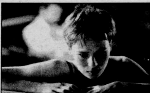
Ariadna Gil is great as Alberto's tortured wife

Alberto has discovered his gay side and pursues it furtively with the even hunkier Diego, a surgeon. Inevitably, the pressure of trying to have the social approval and ease that come with straight life along with a sweaty queer romance on the side causes our protagonist to become both crazed and careless. He can't help but leave a little trail of cell phone messages and hotel receipts, which Elena, of course, discovers.