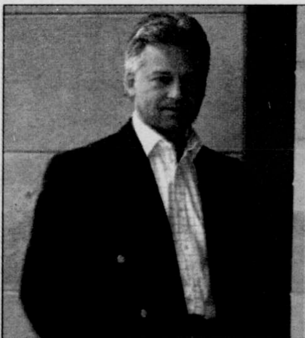
Alan Duncan is the first Tory to come out while still in Parliament

"There were no feathers and fishnets to be seen," noted the local newspaper, the Telegram . The parade wrapped up a week of Pride events.