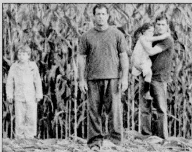
Simple farmer Mel Gibson (and his super-cute brother Joaquin Phoenix) battle alien forces in Signs