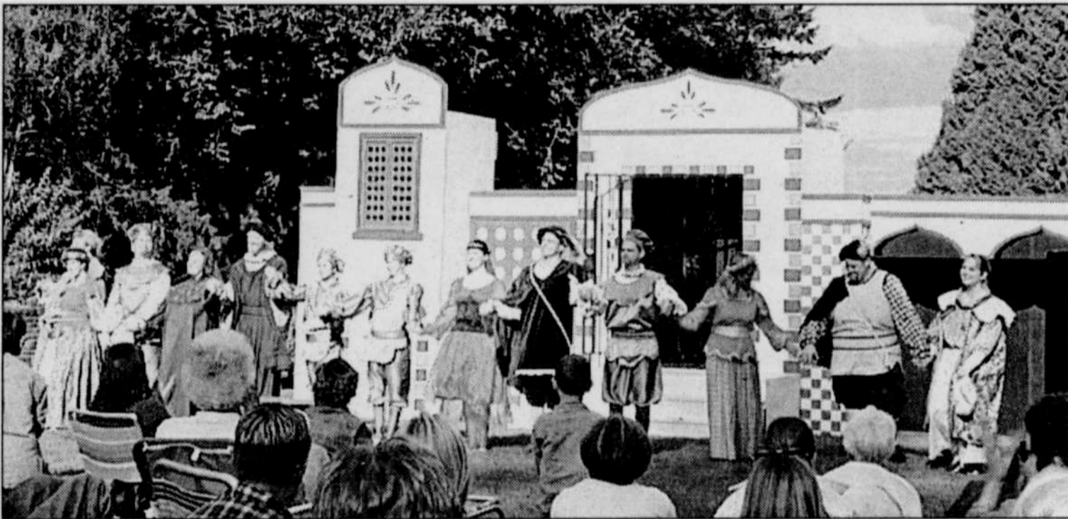
Don't miss Shakespeare in the Park through Sept. 2 at various grassy locations

Parents, Families and Friends of Lesbians and Gays Schools and Youth Team provides information, training, networking and advocacy to make schools safe and fair for all, regardless of sexual orientation or gender identity. (541-242-2746.) (11/02)