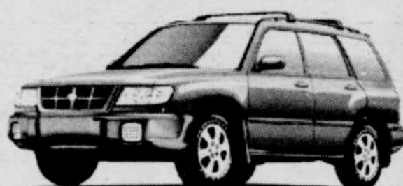
70 Foresters in stock!

Special rates do not apply to 2003 Subaru models.