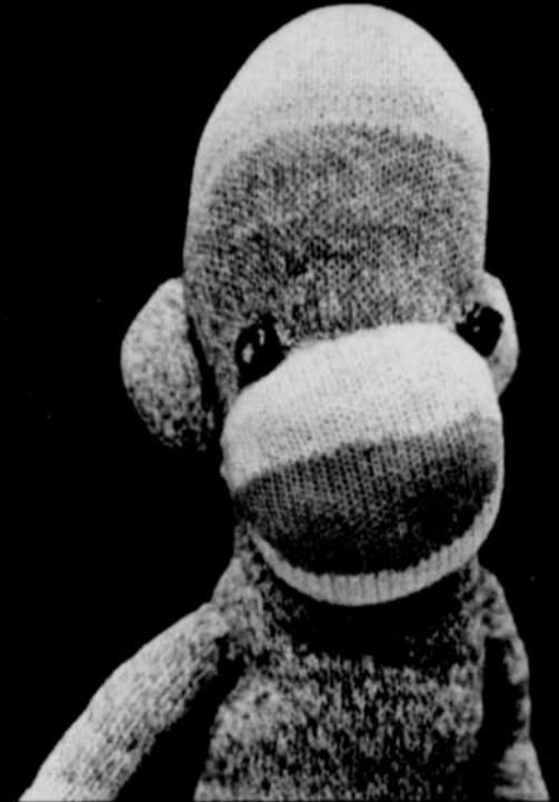
sock Monkey #1586, 2000

Opening Reception Wednesday, July 31, 2002 5:30 - 7:30 pm